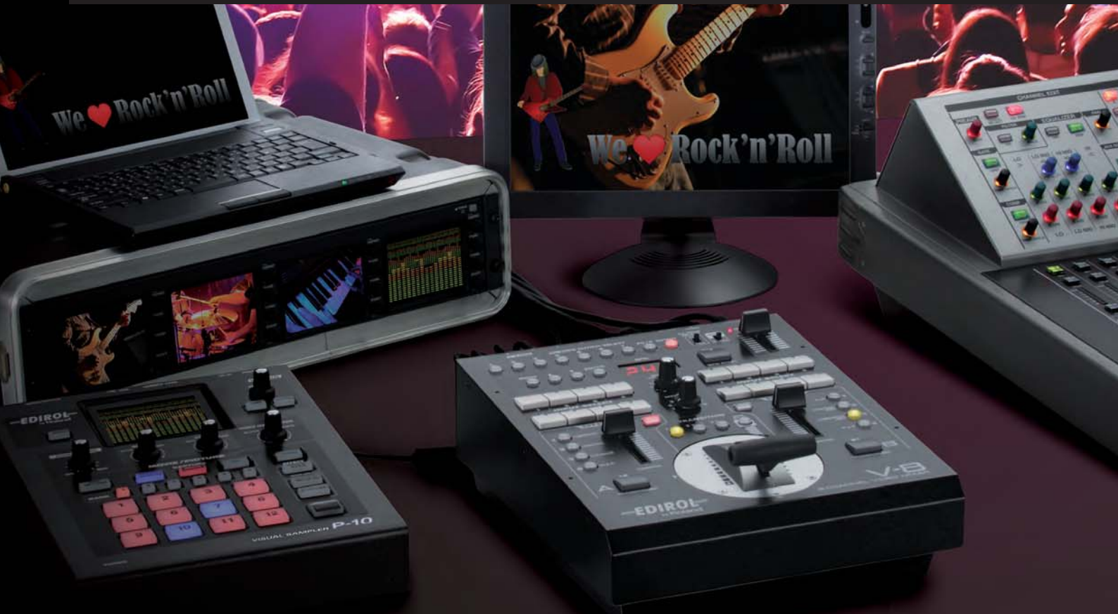
Shown with the P-10 Visual Sampler, the perfect companion for the V-8.